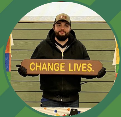
Camp Strake Head Ranger