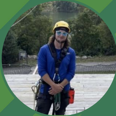
Outdoor Program Director