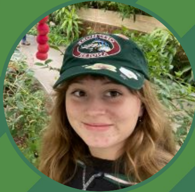
Assistant Program Director