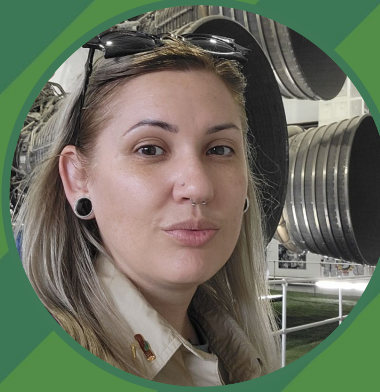
Business Admin Manager