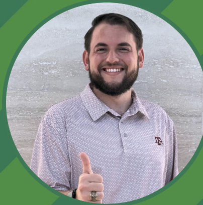
Business and Communication s Director